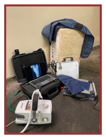
Portable X-ray kit

X-rays are required for a wide variety of reasons. We regularly take x-rays as part of a lameness investigation. In this instance, x-rays allow for careful evaluation of bones and joints. Foot x-rays are frequently required to manage cases of laminitis or poor foot balance. In these cases we can come to your yard and meet your farrier for a great team approach.